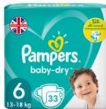
Size 5 & Size 6 Nappies.