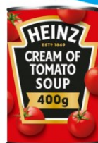
Tinned Vegetarian Soup