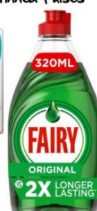
Washing Up Liquid