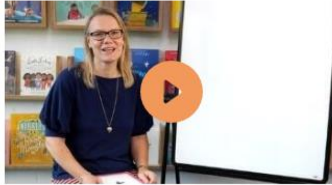
How we teach blending