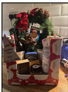
5G - North St Christmas

Can we just take a sec to appreciate these seasonal joys, prepared by your PTA class reps (with help from some elves).