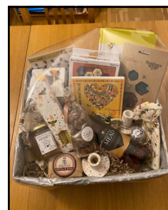
Bumblebees - Bees

These are just three of the 20+ magnificent prizes that are coming your way in our massive raffle , which will be drawn on Christmas Fair day!