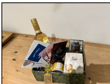
3Y - Wapping Wharf Christmas